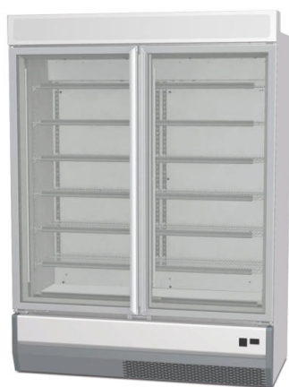
2 door model SRL-CD4075HKP