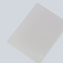
Carrier sheet KV-SS076

*100 - 600 dpi (1 dpi step) (B/W and Colour)