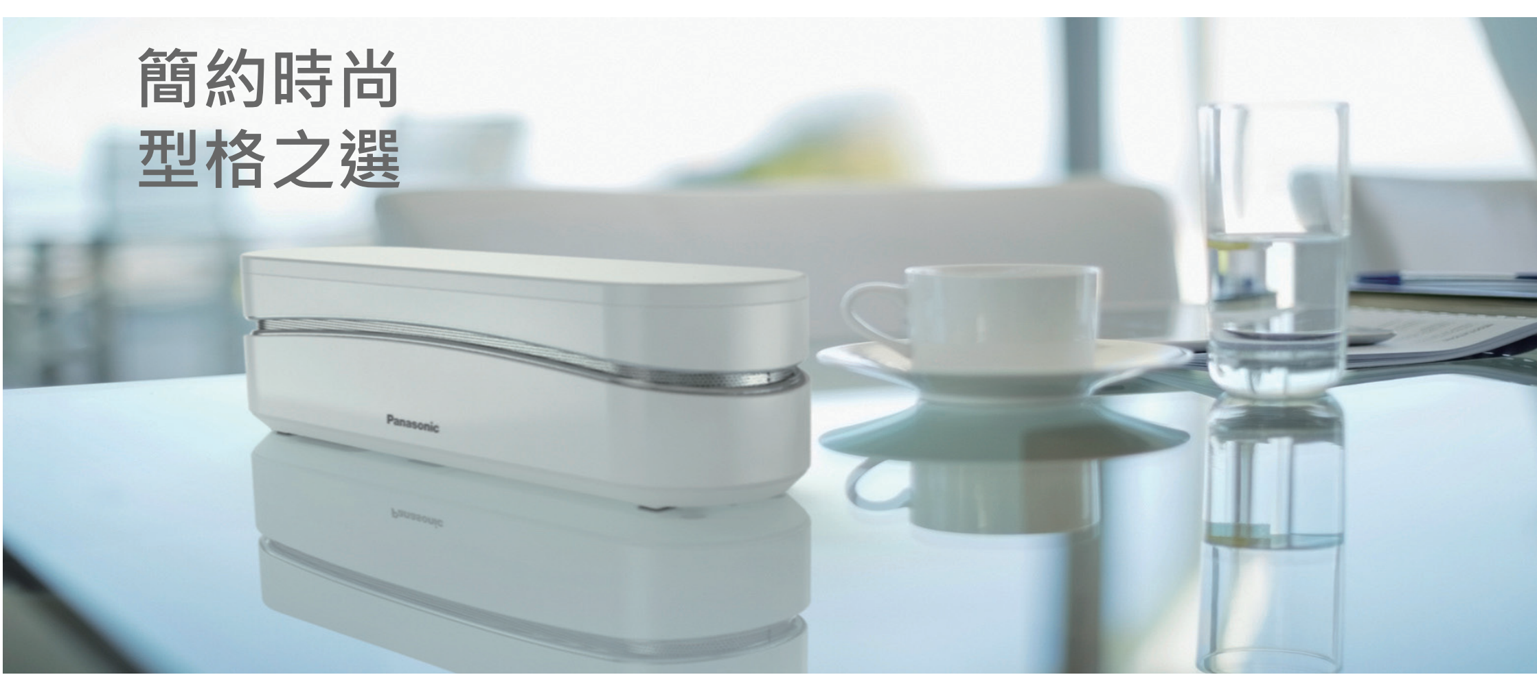
Premium Design 優越設計