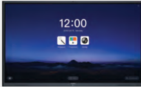
MAXHUB X3 Standard