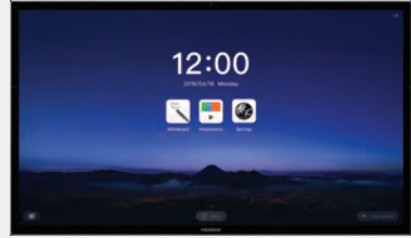
MAXHUB X3 Ultimate