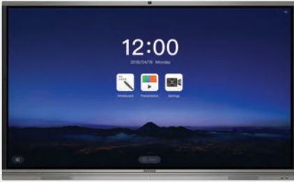
MAXHUB X3 Premium