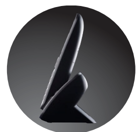
纖巧機身 Thin and Compact Base Unit