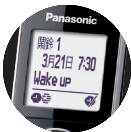
中英文目錄顯示 Chinese & English Menu Display