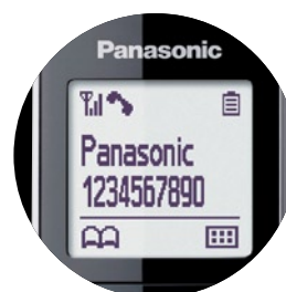
背光燈顯示屏 Easy to See Backlight LCD