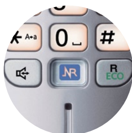
NR降噪功能 Noise Reduction