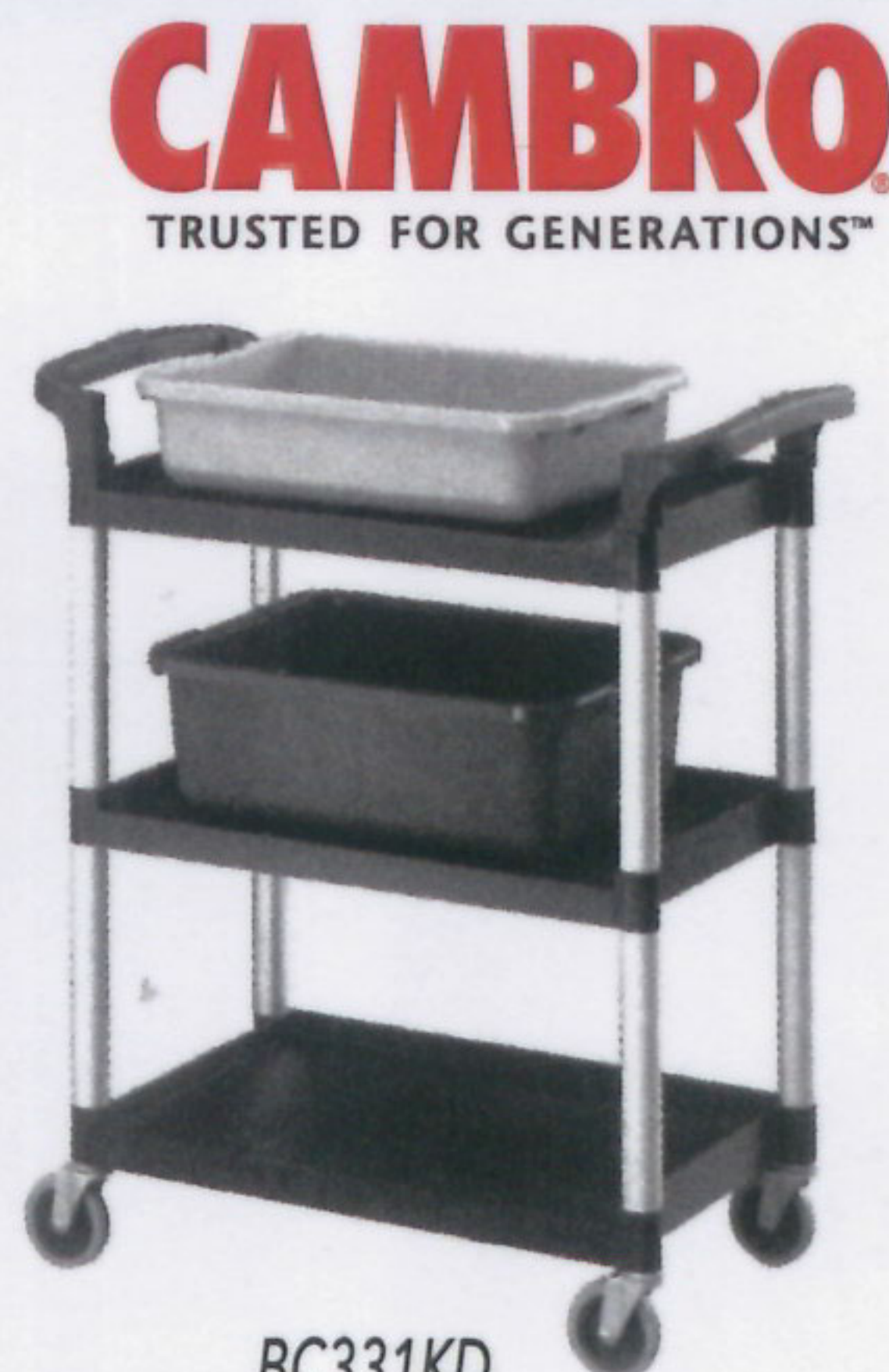
BC331KD (with optional accessories)