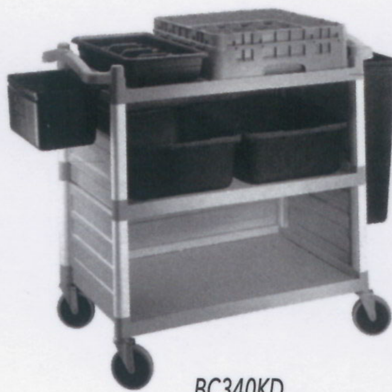
BC340KD (with optional accessories)